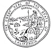
Exhibit - 100-8